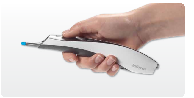
Hold the wand like a pen for drawing or writing, or hold it like a remote control – whichever is more comfortable.