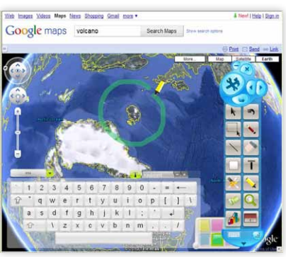
WizTeach InFocus Edition software