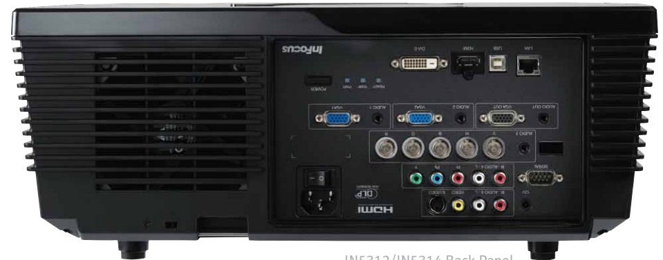
IN5312/IN5314 Back Panel

The 4000 lumens of the IN5314, IN5316HD and IN5318 display crisp, detailed images even in bright rooms. But if even more brightness is needed, you can bump it up to 4500 lumens with the IN5312. Plus, their single-lamp design makes it economical and easy to maintain.